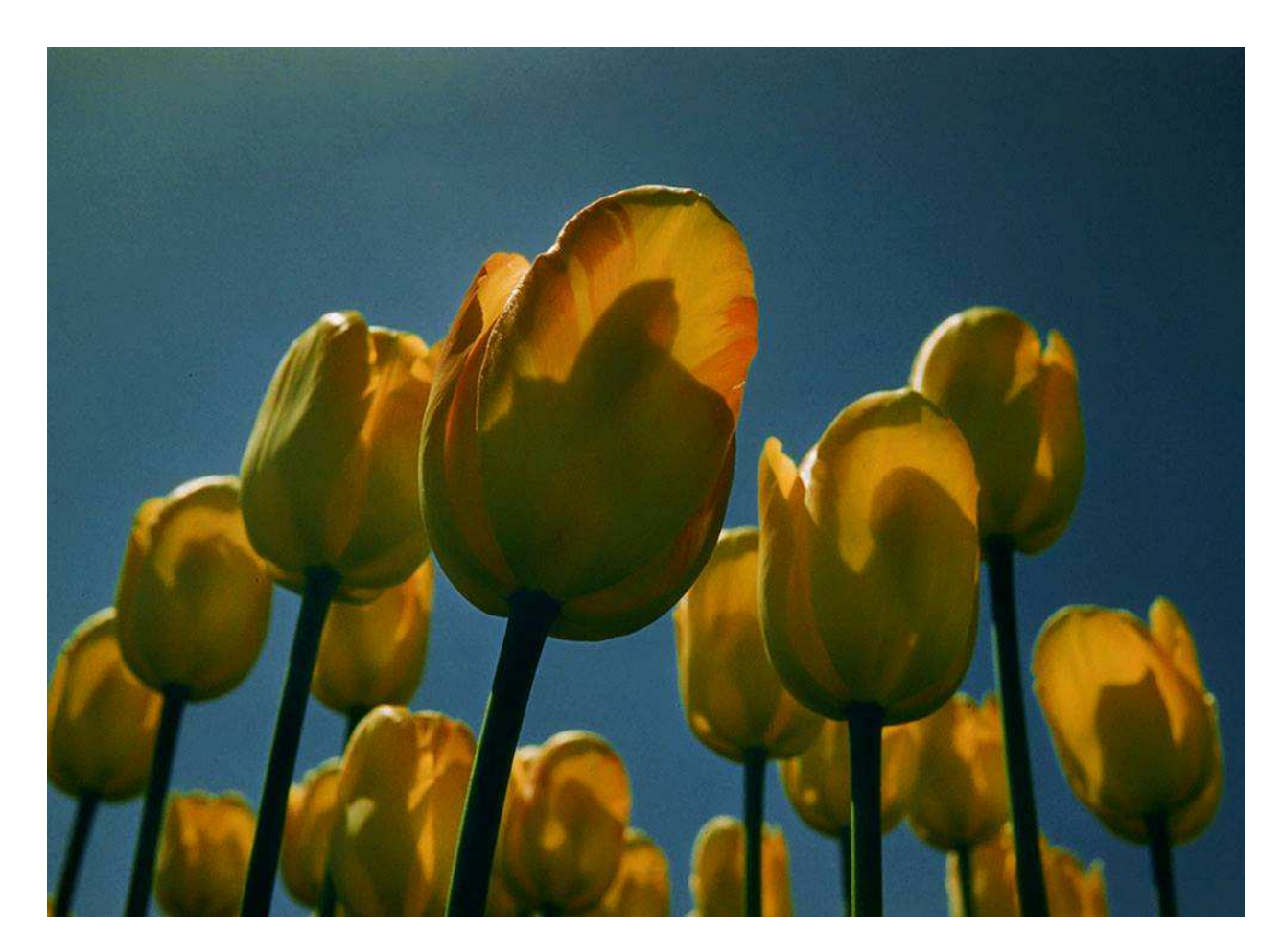
Another close-up shot.