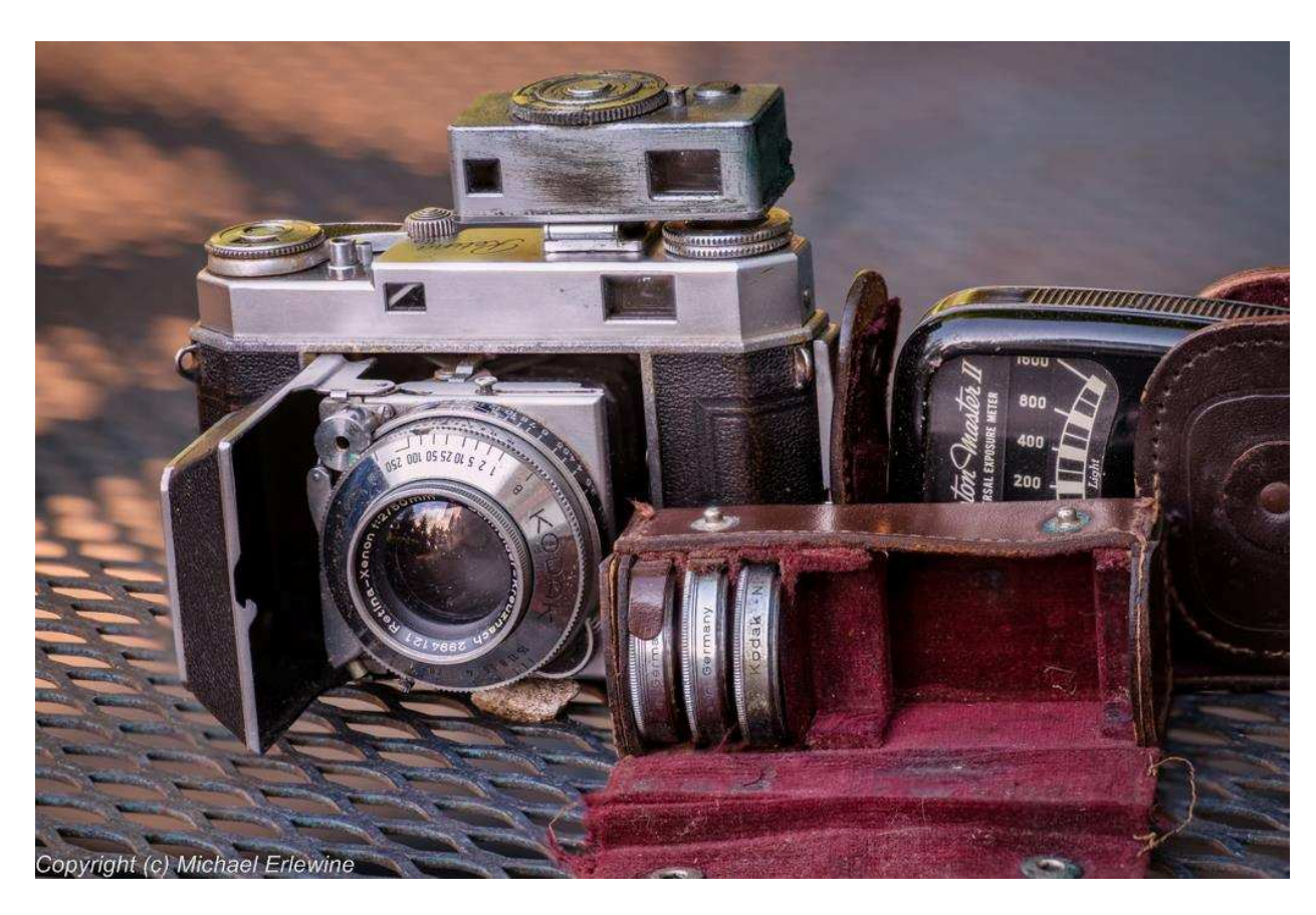
My original Kodak Retina 2a.