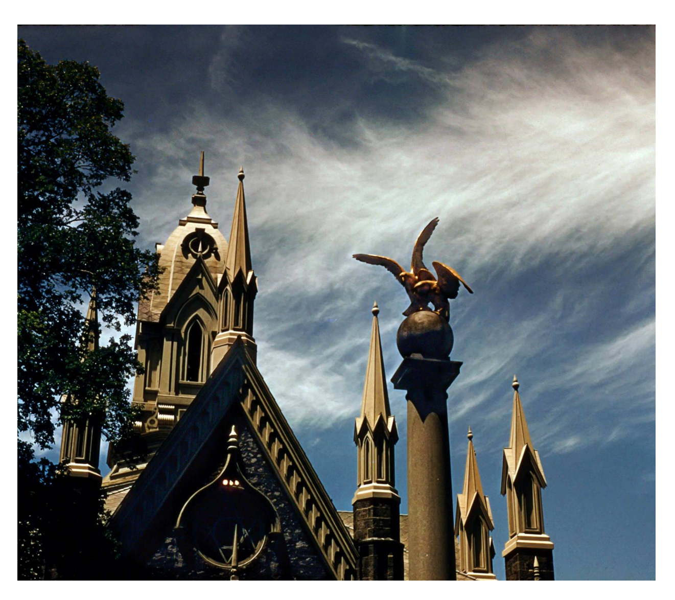
\label{thm:continuous} \mbox{Mormon Tabernacle. I am not a Mormon, but was passing through Salt Lake City.}