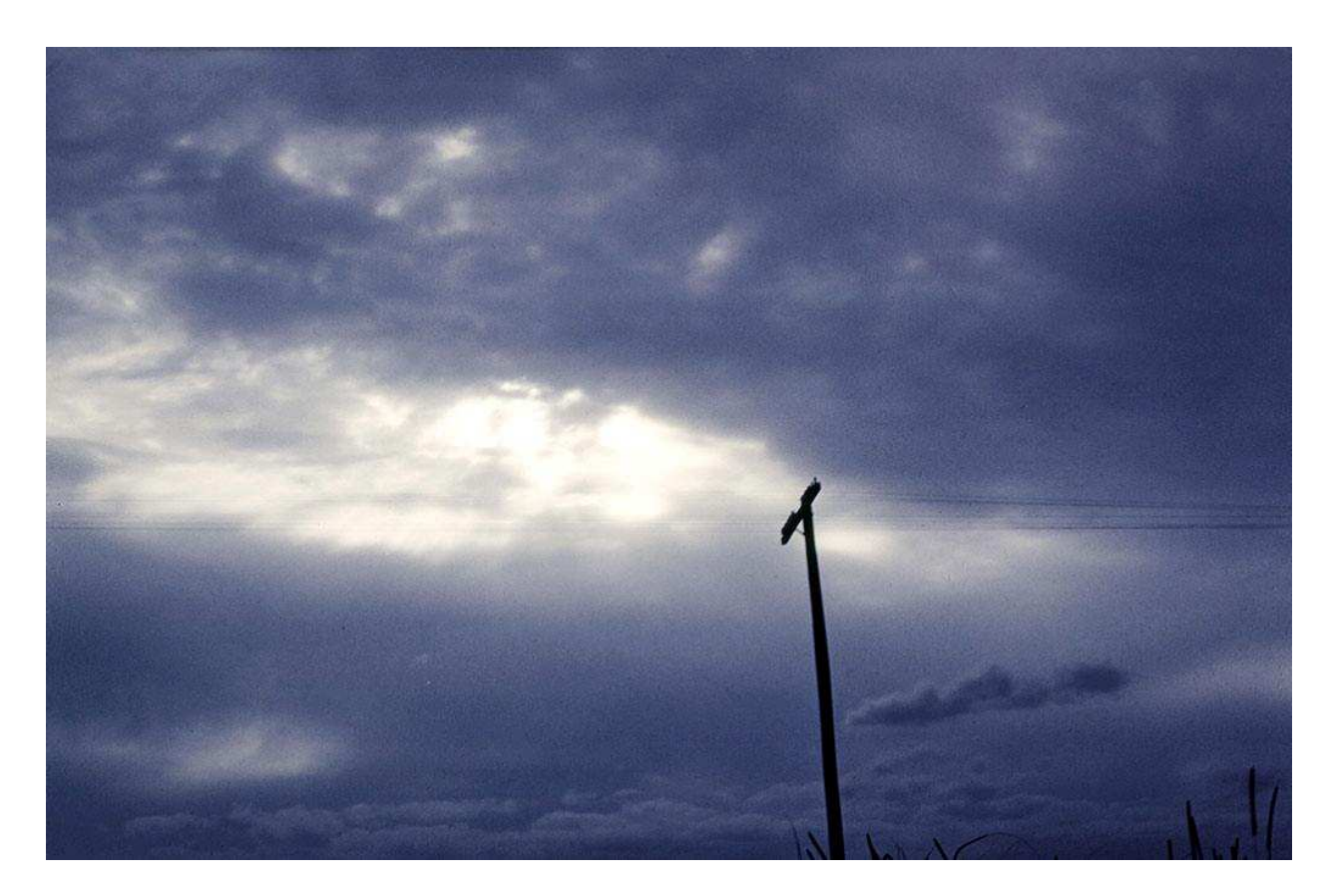
I was moody even then.